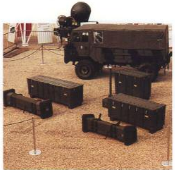
▲ Lightweight storage and transit containers for the MEL microwave landing system (MADGE)