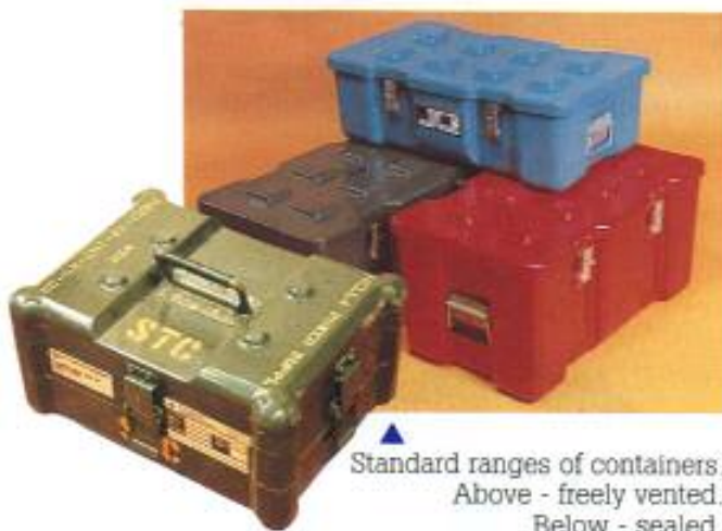
Standard ranges of containers. Above - freely vented. Below - sealed.

Glass reinforced plastic (GRP) containers can provide cost effective solutions to containment problems. Standard and custom designed units can be produced for both military and civil applications, either sealed or freely vented, and in a wide range of materials. These include polyester and epoxy resins, polyurethane foams and phenolic resins. EPS Logistics Technology Ltd has full design facilities as well as the production capability.