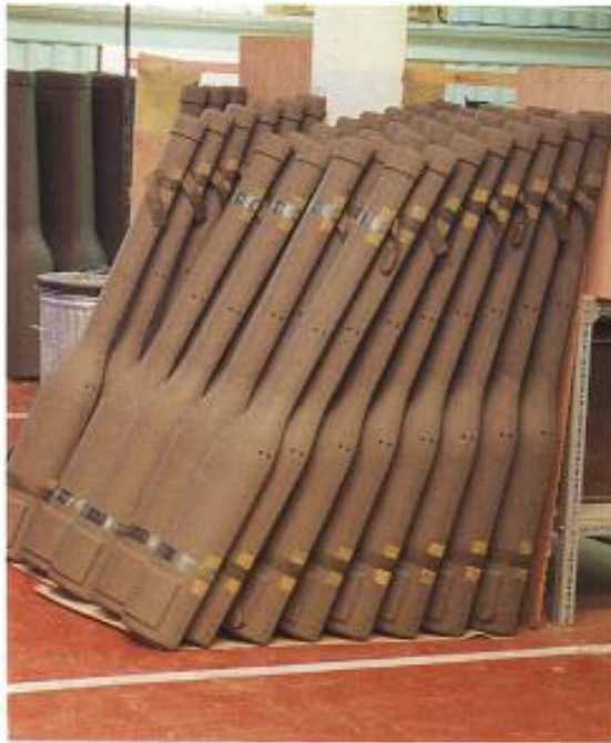
▲ Glass reinforced foam container for lightweight missile system.