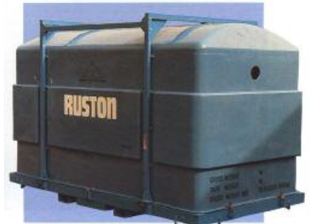
▲ An example of the larger transit container, for high-value capital equipment in the off-shore industry.