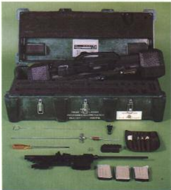
▲ Transit container (glass reinforced foam) for the Hunting Engineering Limited Outdoor Trainer for the LAW 80 anti-tank weapon.